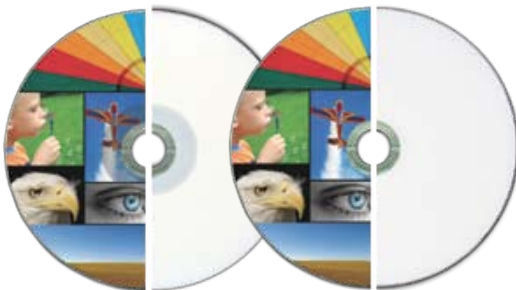
Generic inkjet media FalconMedia inkjet media Shade variation in the center Uniform shade across the whole surface