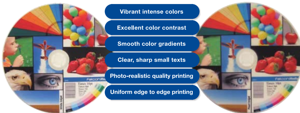
White inkjet printable